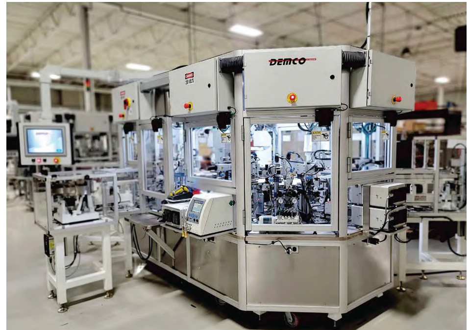
A pair of rotary indexing dials are used to assemble an actuation device for a surgical instrument.

Grand View attributes that growth to the increasing number of surgical procedures, the rising incidence of hospital-acquired infections, and, of course, the COVID-19 pandemic. A growing prevalence of chronic diseases, such as diabetes and