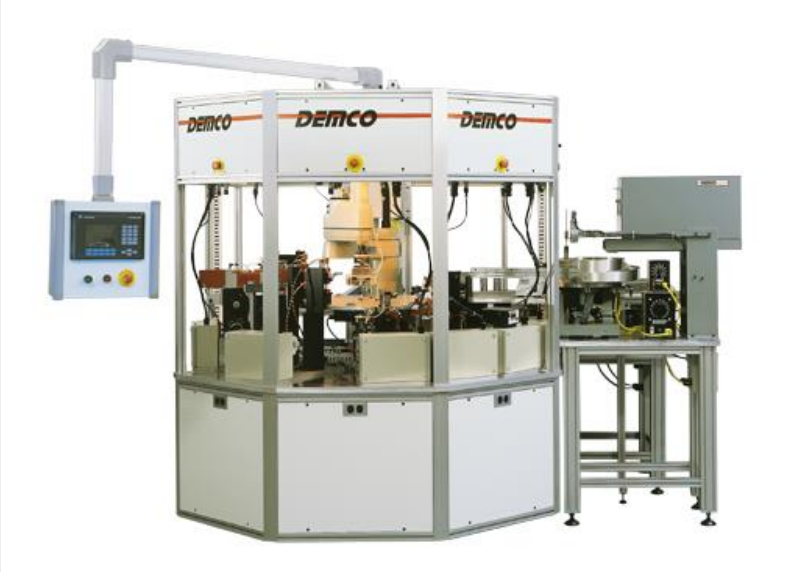
SD-10 Base Chassis with integrated SCARA robot, feeders, and Wedge Stations

In the final phase, 16 Base Machines were delivered to the customer with the balance of Wedge Stations required to complete the assembly process. During the installation of the systems, the existing bench top units were reused by plugging them into the Base Machine. This approach minimized project risk, provided immediate benefits to production by the implementation of bench top stations first, and realized a shorter ROI by reusing stations in the fully automated process.